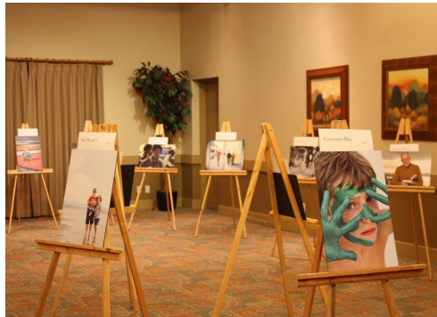
New Faces of British Columbia exhibit at the Fraser Valley Cultural Diversity Awards, Abbotsford