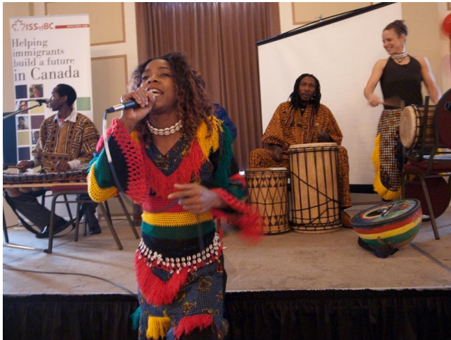
The Doundounba African Drumming and Dance Ensemble entertains an enthusiastic crowd at Heritage Hall.